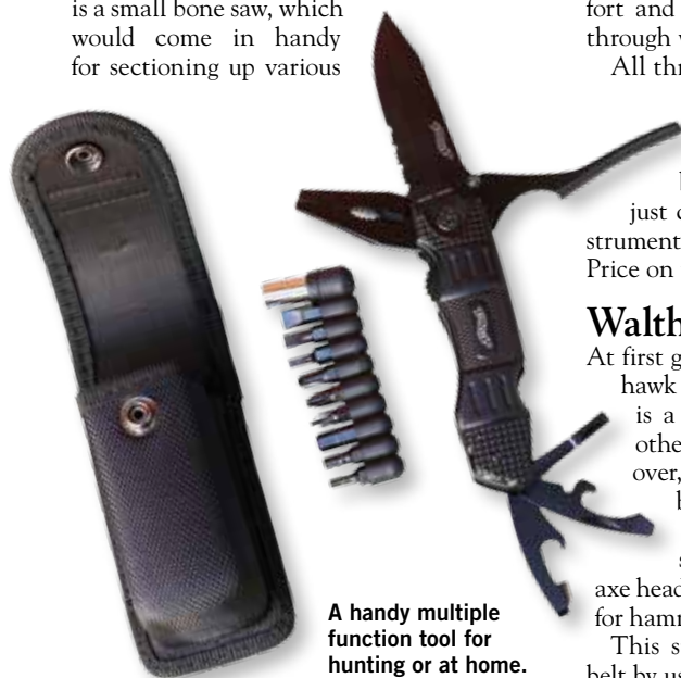
A handy multiple function tool for hunting or at home.