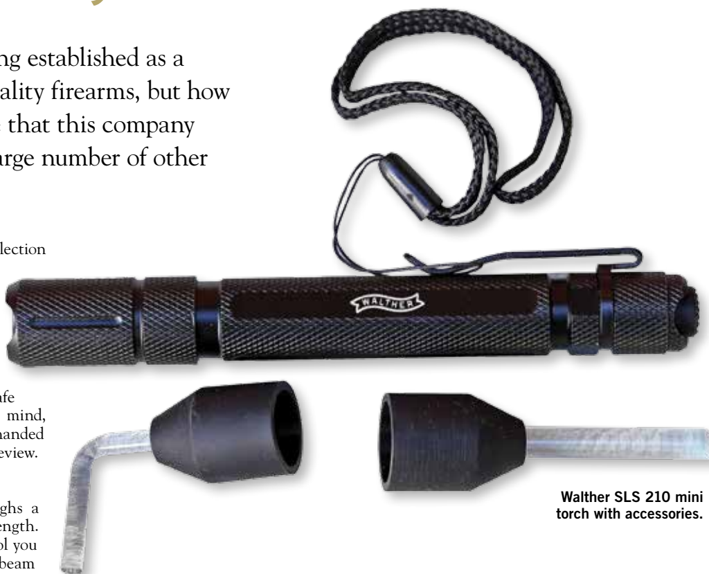
Walther SLS 210 mini torch with accessories.

Also supplied is a lanyard, which is always handy for those situations where dropping the torch might prove costly. Walther does not claim this torch to be water proof, so be warned and use a lanyard. When in your shirt pocket there is a retainer clip, similar to that of any good pen.